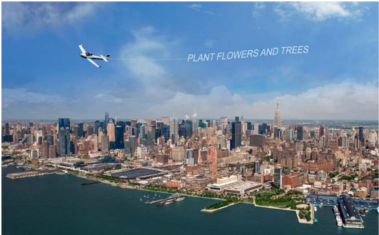
View over Hudson River towards Manhattan