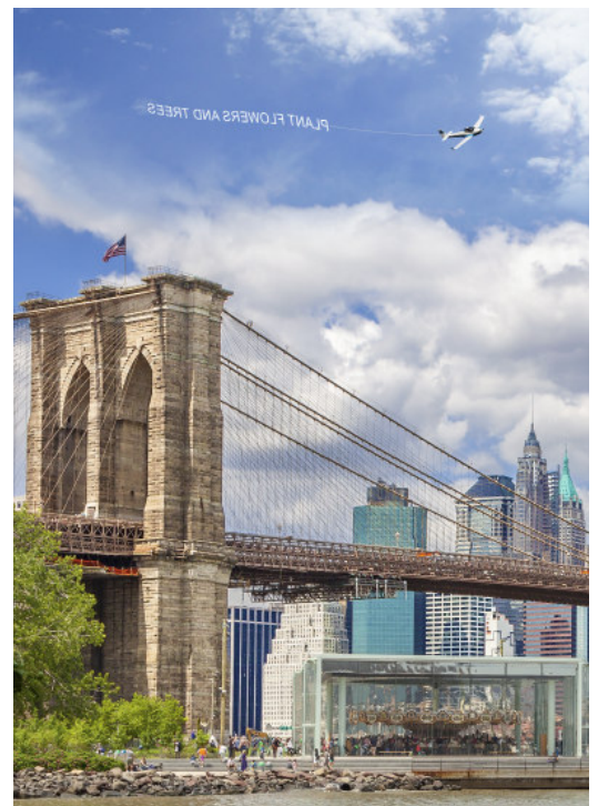
View over Brooklyn Bridge towards the Financial District with the banner seen from the rear